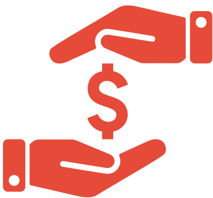
REDUCED COST OF OWNERSHIP