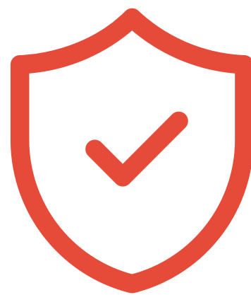
SAFE AND RELIABLE TECHNOLOGY